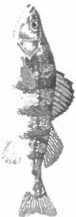
Panfish - Yellow Perch, Crappie, Sunfish (all varieties) - no limit