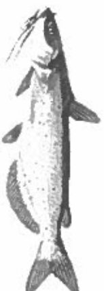
Catfish - Channel and Bullhead please do not return the fish to the lake