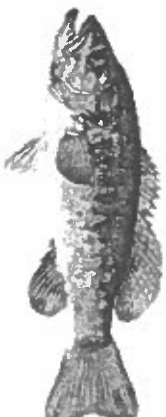
Smallmouth Bass - Catch and Release