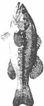
Largemouth Bass - 3 per day with only 1 over 15 inches

It's no surprise to our anglers that Cinnamon Lake has a lot of small fish and not many big ones! We've had recent input from fisheries management professionals and have been advised that our lake and especially our average fish size would benefit from some fish harvest. The 2024 fish limits are based on that advice: